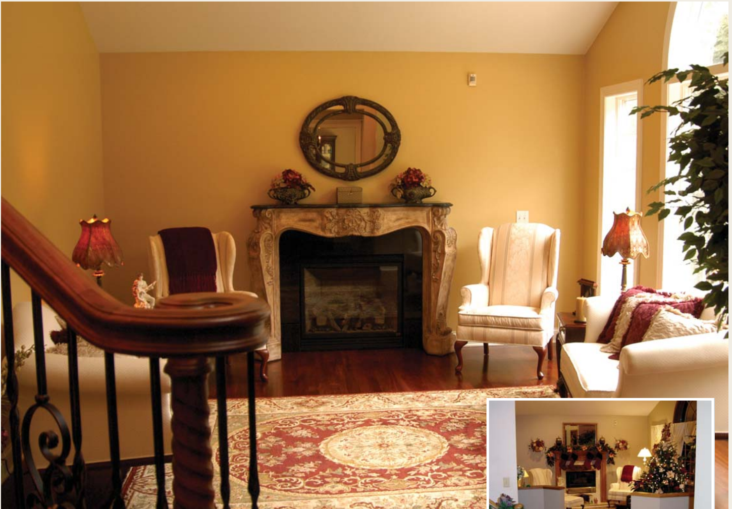
Elegance and charm are enhanced with the new fireplace surround.