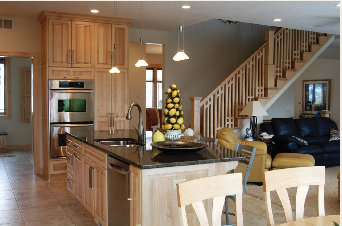
This beautiful Showcase kitchen, along with the mission staircase railing, adds drama to any room. Cabinetry from Showcase Kitchen and Design.