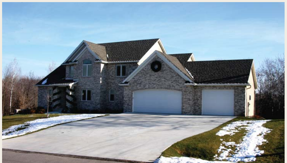
The full brick front exterior of this home is not only maintenance free, but it is extremely beautiful.

Builders is not a cookie cutter operation. Whether it is a custom home or remodeling project, Seavey Builders