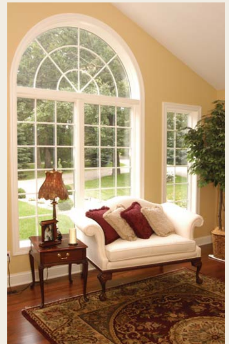
The beautiful view is framed by this fabulous Pella window.