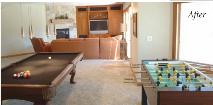
Plenty of space for game tables and entertainment.

Kathy Brandt says the stainless steel base at the bar is the most unique feature.